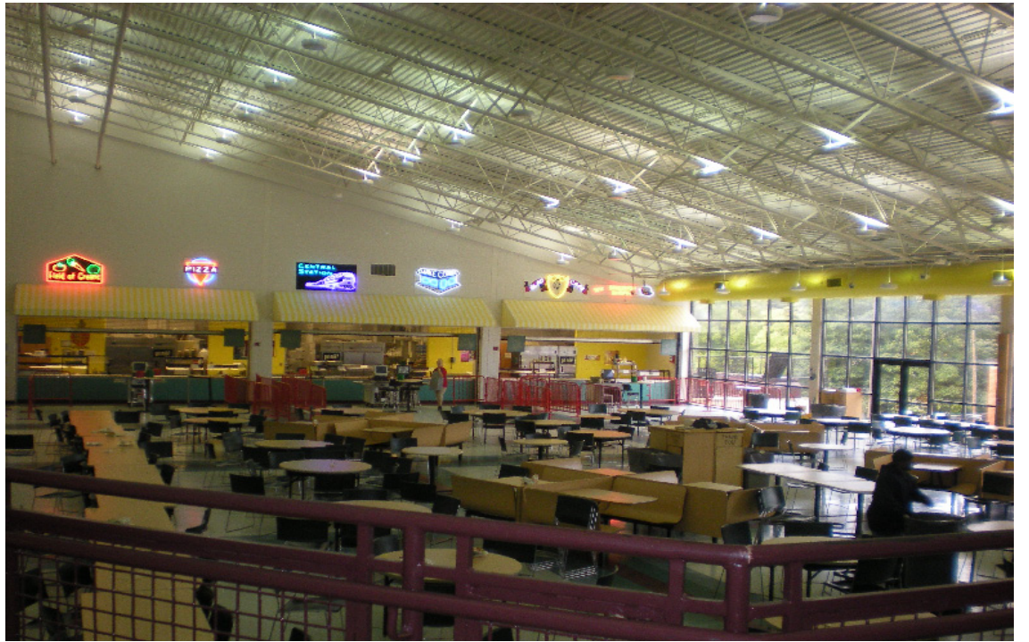
This school's cafeteria is modeled to look like a mall food court.