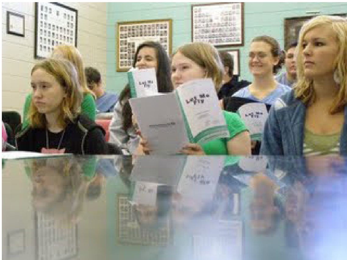
Students in chrous at Oconee County High School know that excellence takes practice, and all are more than willing to put in the time for a successful concert.